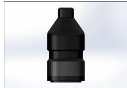
Sunnex SL3 Lamp Head